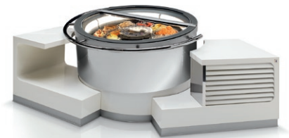
PUNTO GELATO ITALIANO (BUILT-IN COMPRESSOR)

A new product has now been added to our range of highly popular models: