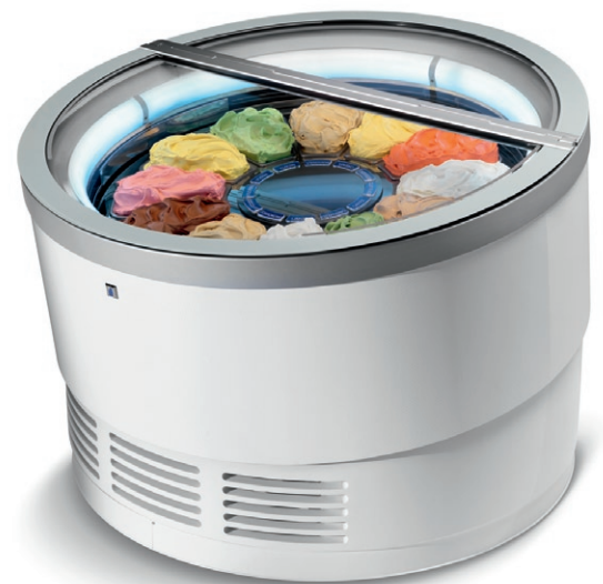
TONDA UC ROUND BASE (WITH BUILT-IN COMPRESSOR)

Due to the recent improvements, TONDA UC now offers the same excellent performance of the original TONDA at a highly competitive price.