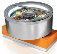
TONDA NUC (REMOTE COMPRESSOR) BASE 1500 mm