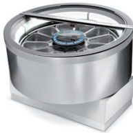
TONDA NUC (REMOTE COMPRESSOR) BASE 1350 mm