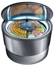
TONDA NUC (REMOTE COMPRESSOR) ROUND BASE

THE COMPRESSOR IS HIDDEN UNDERNEATH: IFI HAS EXTENDED ITS "TONDA" PRODUCT RANGE. THE SUCCESS OF THE FIRST AND ONLY ROUND AND ROTATING DISPLAY CASE, DESIGNED BY MAKIO HASUIKE AND DEVELOPED AT IFI'S RESEARCH AND DEVELOPMENT CENTER, HAS BEEN THE SPUR FOR CONTINUOUS RESEARCH AND IMPROVEMENTS ON THIS PRODUCT THAT REMAINS UNRIVALLED TO THIS DAY.