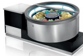
TONDA UC ADJACENT CONDENSING UNIT (BUILT-IN COMPRESSOR)