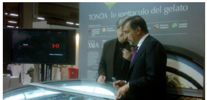
Milano. The Defence Minister, the Hon. Ignazio La Russa, and the Chairman of the Symbola foundation, Ermete Realacci observe IFI S.p.A.'s Tonda gelato display case carefully, an international icon of design applied to technology. Tonda, the first ever round, rotating display cabinet, is a 100% made in Marche product, designed, developed and manufactured in the plants of Tavullia (Pesaro-Urbino), and sold throughout more than 40 countries the world over.