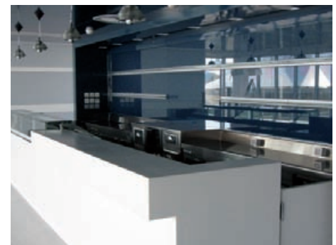
PHOTOS: THE INSTALLATIONS INSIDE THE DRAGSTER BUILDING, IN THE COMPLETION PHASE.

with a countertop made of "stardust" black agglomerate. Like in the Media Center, the fittings are accompanied by Snack & Food display cases, in this case with the addition of the "Bain-marie" version.