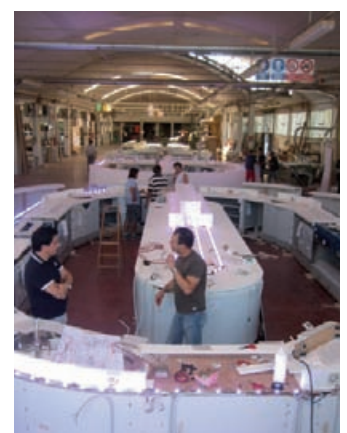
PHOTOS: PROJECT FOR THE PANORAMIC TERRACE AT CRASH CLUB; THE CRASH CLUB TERRACE DURING ASSEMBLY; FITTING TESTS FOR THE CRASH CLUB INSTALLATIONS, AT THE IFI PRODUCTION FACILITIES.